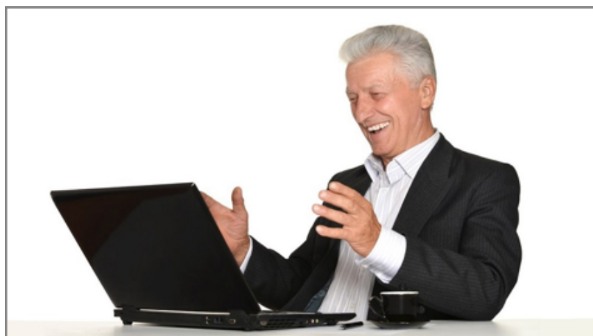
The final consultation round has concluded.

A series of consultation rounds has been completed, considering first the principles