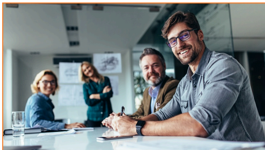
It's time to get down to the nitty gritty.